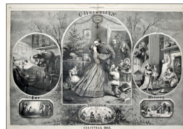
Harper’s Weekly, Dec. 26, 1863, edition

The Civil War saw its third Christmas in 1863. The soldiers on both sides understandably yearned for their homes and families.