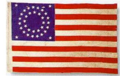
Fort Sumter flags, 1861 and 1865

On June 20, 1863, West Virginia was admitted to the Union, resulting in the flag having 35 stars as of July 4, 1863 (the day Vicksburg fell to Ulysses S. Grant and Robert E. Lee's army was retreating back to Virginia from Gettysburg). It was the 35-star flag that continued to be flown through the remainder of the war, and it was this flag raised over Fort Sumter on February 18, 1865, marking the fort's return to federal control. Although Nevada was admitted to the Union on October 31, 1864, the star reflecting its admission was not added until July 4, 1865, well after the surrender of the South's armies in the field.