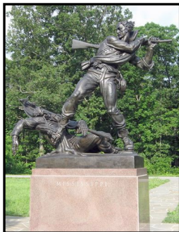
Mississippi Monument, Gettysburg

About 80,000 men from the Magnolia State served in the Confederate forces and some 8,000 of them died during the Civil War. Approximately 500 white and more than 17,000 black men from the state fought for the Union cause.