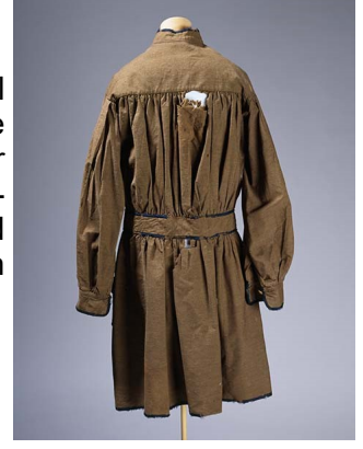
Rear view of Hoke's "Camp Coat"

This coat is one of several items related to Hoke in the museum's collection; other items include his headquarters flag, frock coat, sword and sword belt, and death mask.